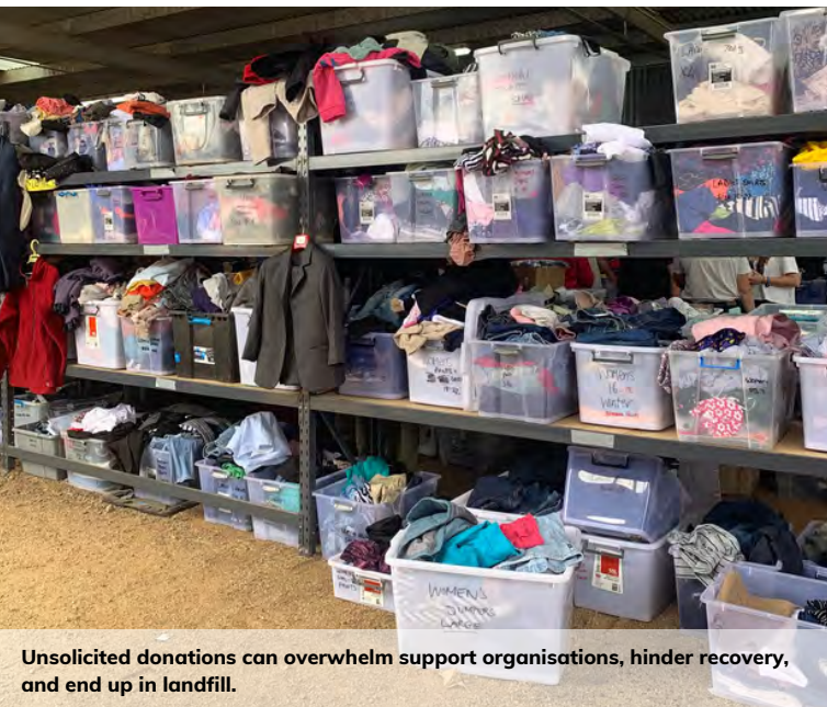
Unsolicited donations can overwhelm support organisations, hinder recovery, and end up in landfill.

We aim to ensure people devastated by disaster get exactly what they need to recover, where and when they need it. We aim to make it easy for big-hearted Australians to have the greatest possible impact.