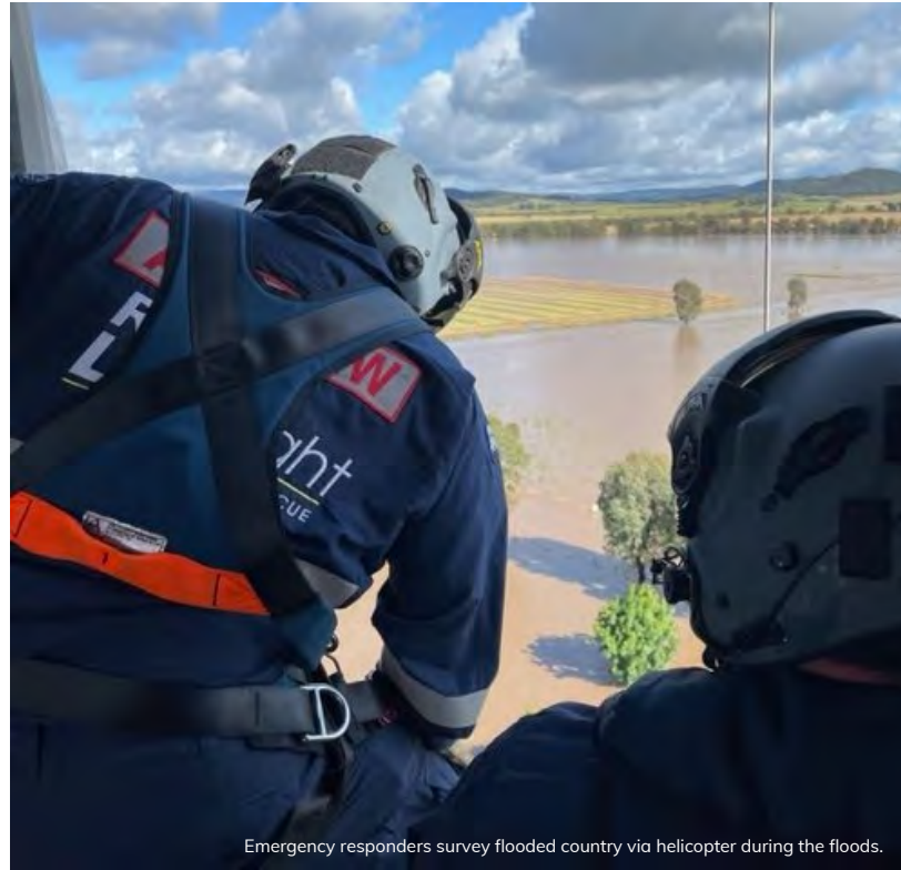
Emergency responders survey flooded country via helicopter during the floods.