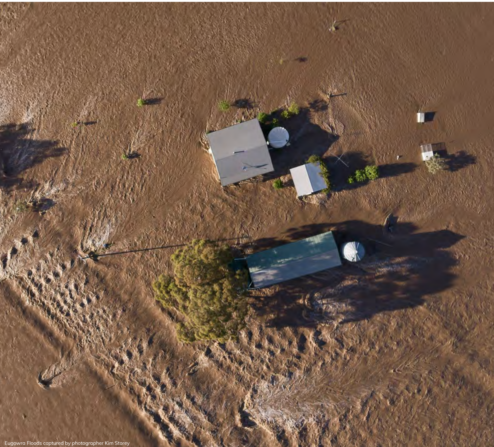
Eugowra Floods