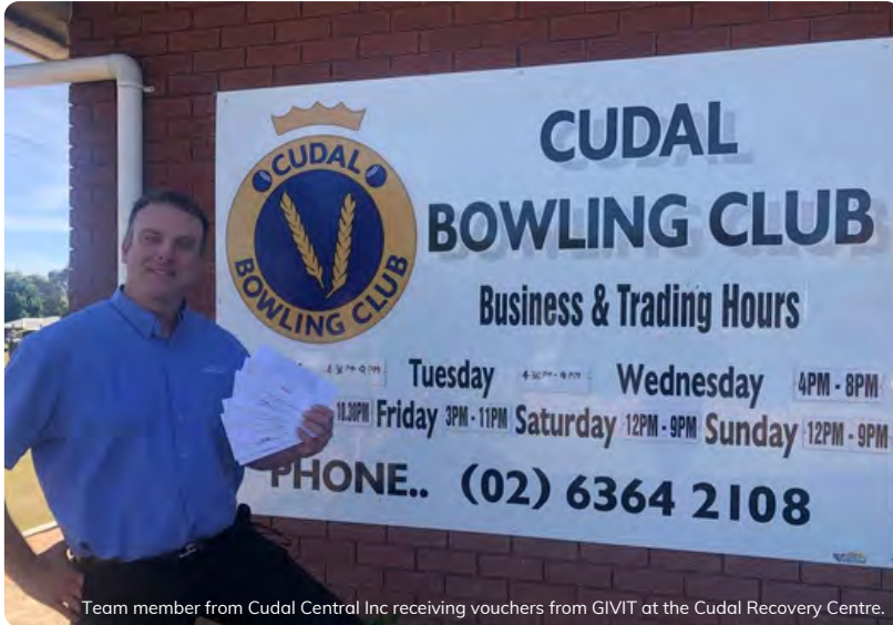
Team member from Cudal Central Inc receiving vouchers from GIVIT at the Cudal Recovery Centre.

One particular request came from a family who lost everything. After more than 3 months, they finally moved back into long-term accommodation, and needed a dining table and other furniture for their new home.